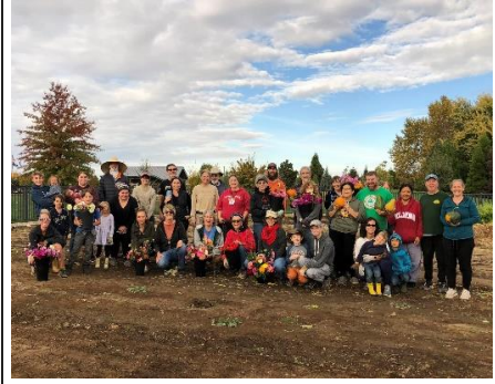
Our end of season, last day photo.

Although a few families left before October, we ended the garden season with 27 families and our roster for the 2024 season is full.