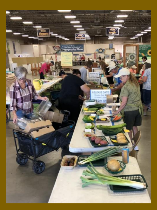
Dropping off our entries at the fair.